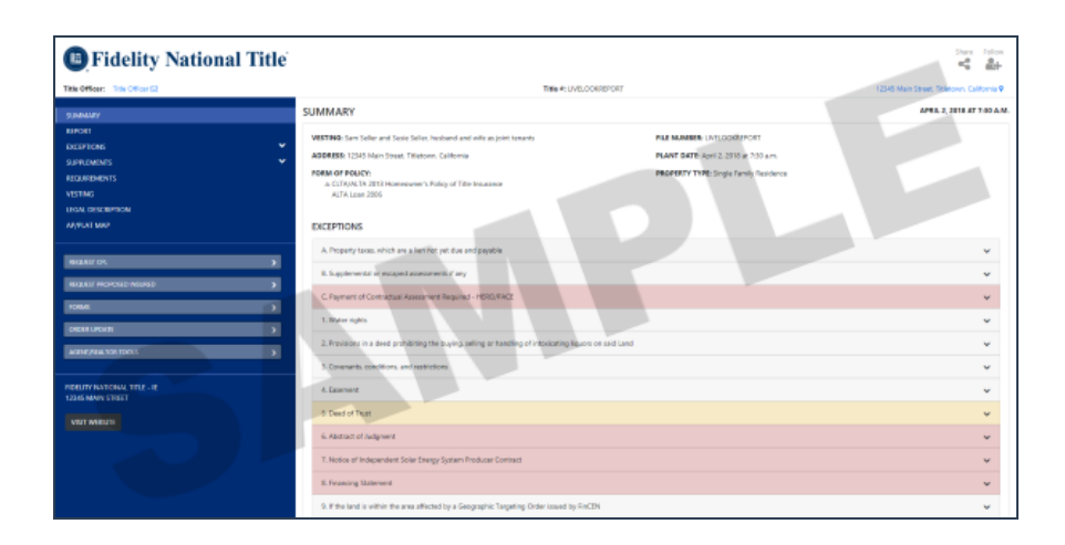
Effortless, Efficient, Compliant, and Accessible

To view your new Fidelity National Title First Alert powered by LiveLOOK report, Click Here