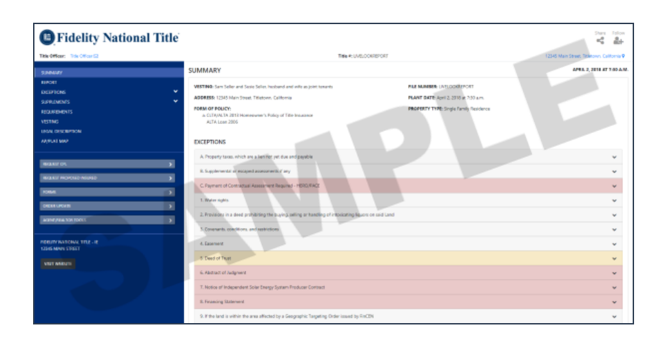
Effortless, Efficient, Compliant, and Accessible

To view your new Fidelity National Title First Alert powered by LiveLOOK report, Click Here